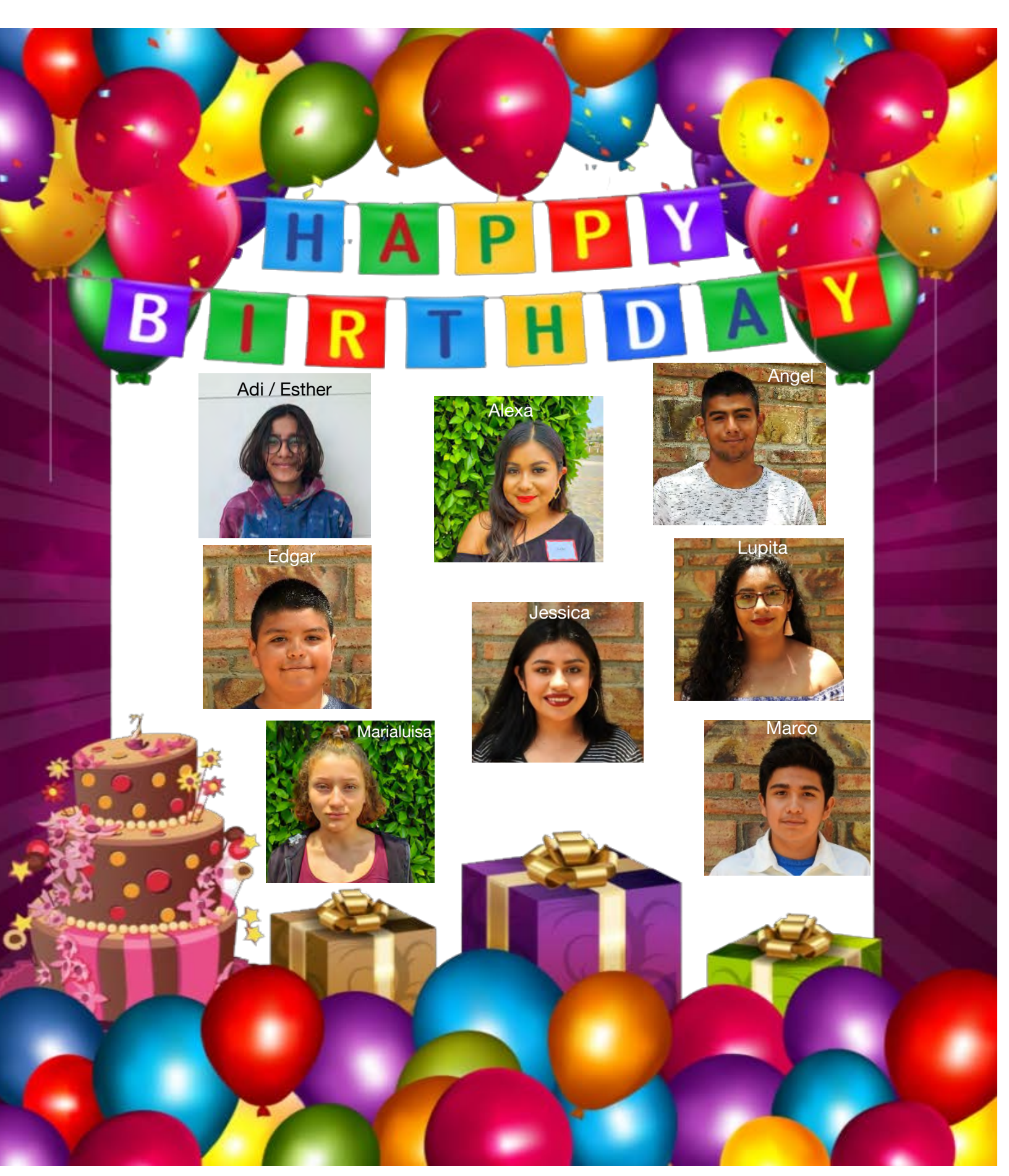
Page 2 of 19