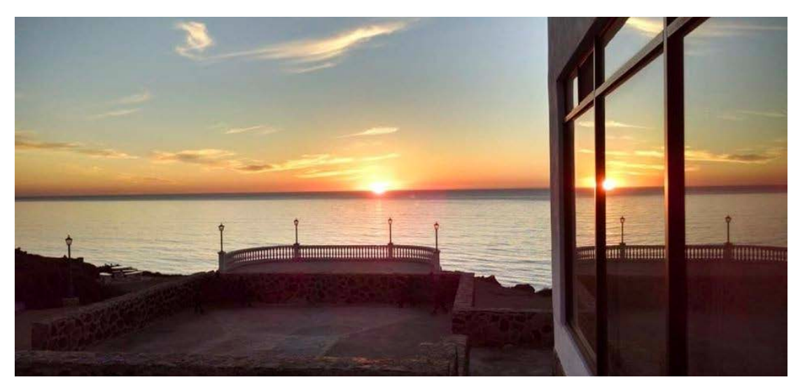
Page 15 of 19

BSF & Cruz Roja Primo Tapia A Bizarre Bazaar Fashion Show & Auction Thursday, June 24, 2021