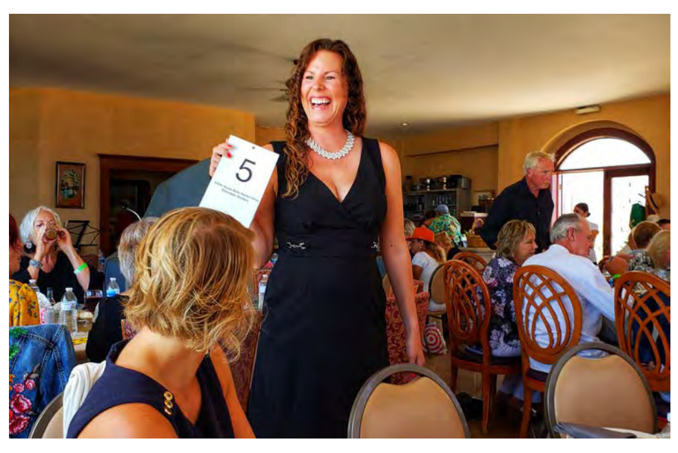
Page 16 of 19