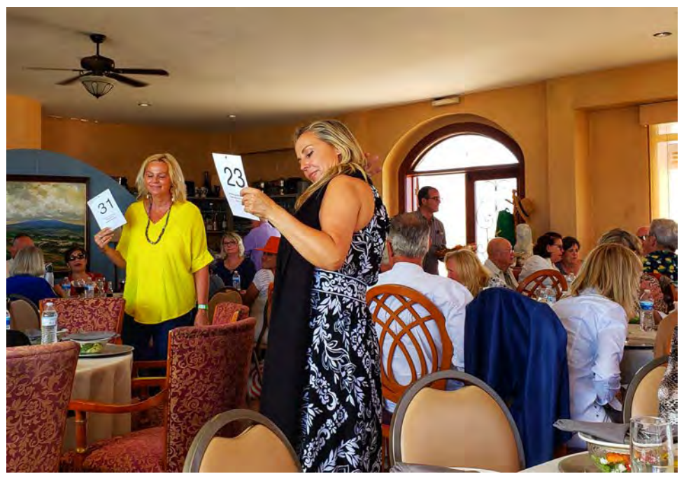
Page 17 of 19