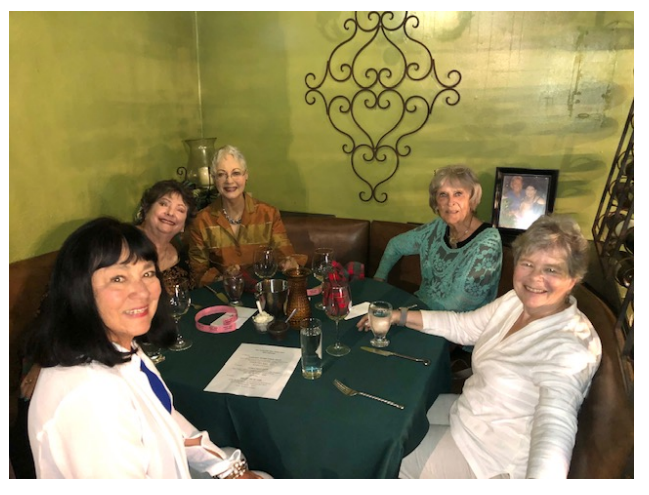
Friends and acquaintances getting together to support a good cause